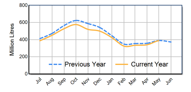
VIC Milk Production - Northern Region