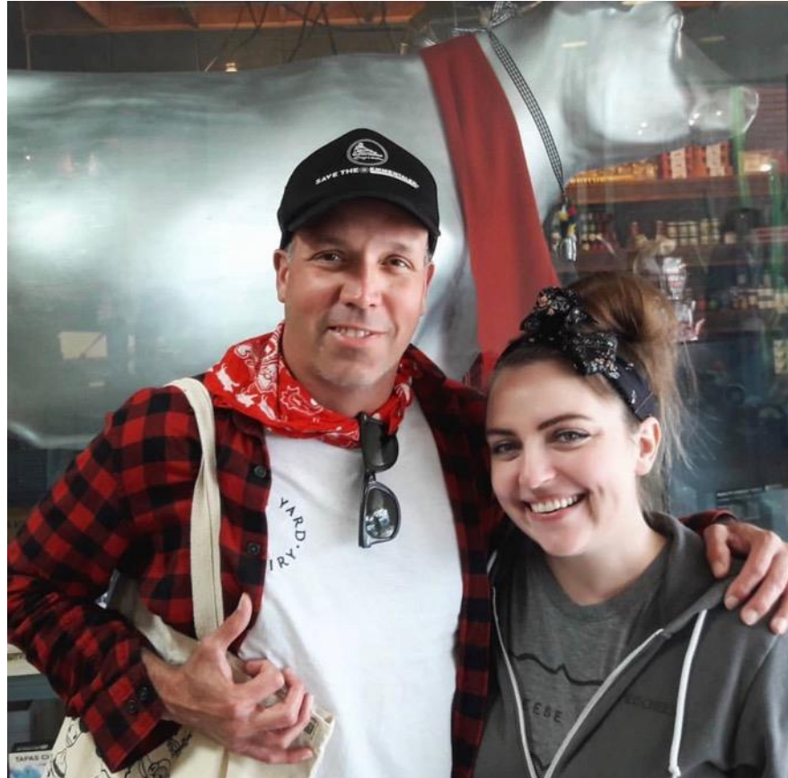
Core consumers, Super Fans (Trade/Consumer), Influencers