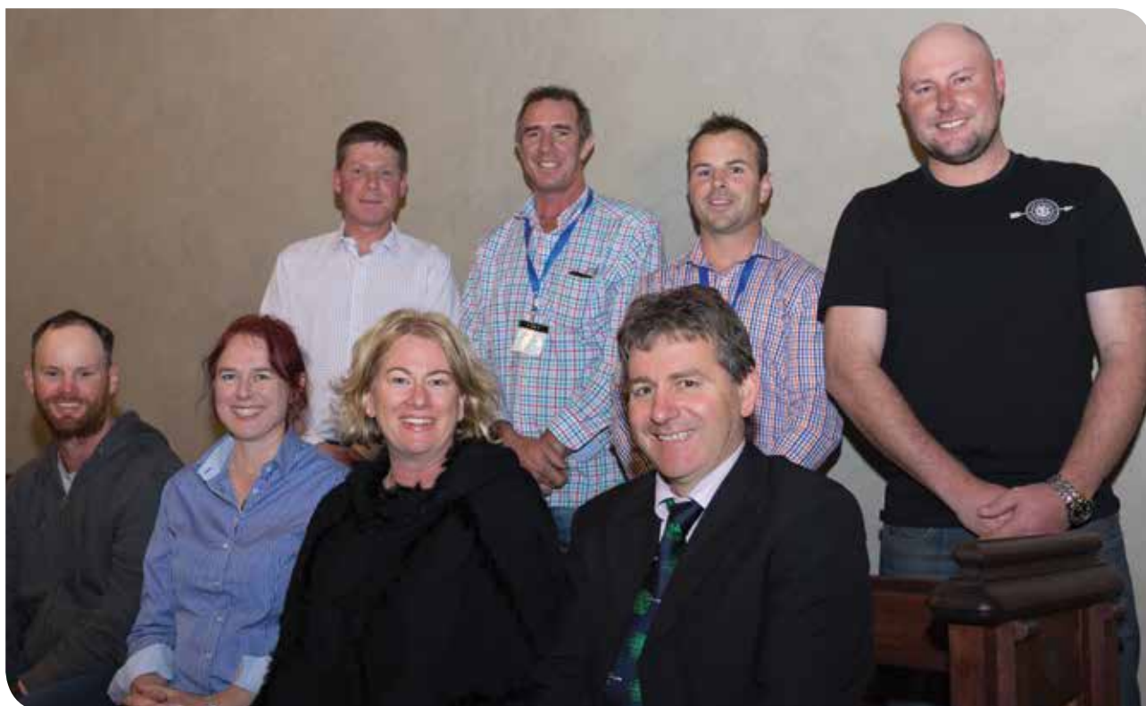
The DairySA board