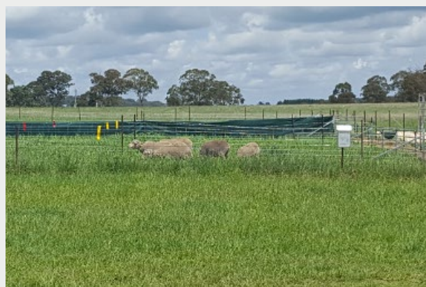
Figure 2 Photograph of the virtual fence sheep at pasture. The paddock was divided into six laneways (8 m wide), and animals were restricted to a section of the lane each day. The yellow tape on the fence indicates the virtual fence boundary (8 m length)

Sheep in both the virtual fence and the electric fence treatments were successfully restricted to their plots throughout the trial. Consumption of pasture was similar as there was no difference between treatments in the crop biomass removed after each grazing. Furthermore, implementation of the virtual fence in a small area did not impact the behavioural patterns of the sheep. The results of this study showed that using VH technology to manage intensive grazing of a small flock of sheep in a restricted area is effective and does not negatively impact their welfare.