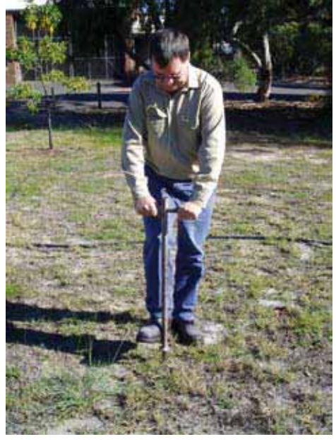
Figure 3.2 A sampling pogo is a metal tube about 2.5 cm in diameter that is pushed into the soil to a depth of 10 cm.