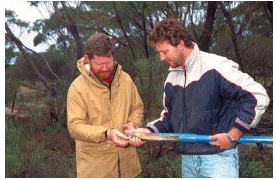
Augers make sampling hard-setting soils much easier

The tables below are provided as general guides to help you understand your soil test results. Discuss your test results with your farm consultant or an experienced agronomist prior to making any fertiliser decision.