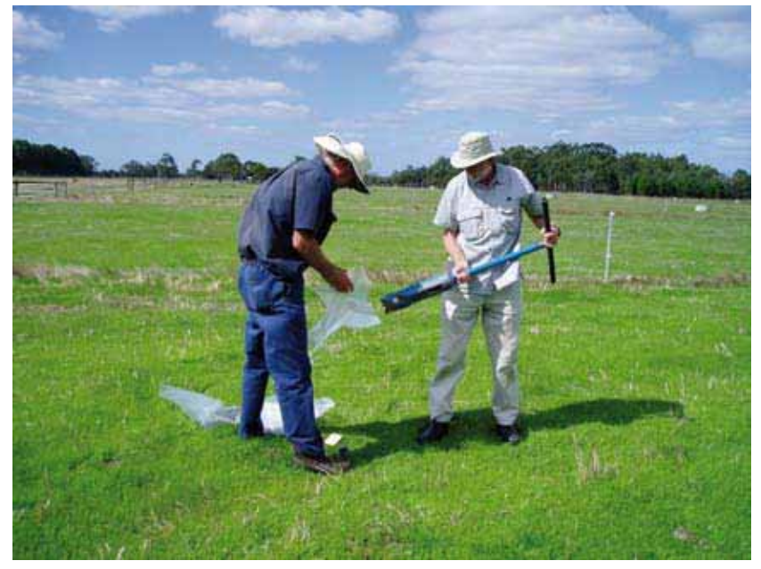
Figure 3.1 Soil sampling using an auger

When sampling, check that cores are the right length (the auger has gone down to the right depth). Cores that are too short or too long will give incorrect readings. Make sure that no soil falls out of the auger as you lift it out of the ground.