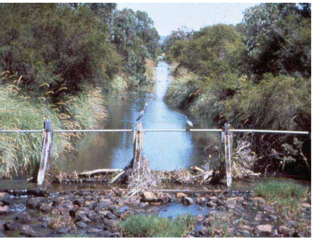
Streamlined main drain in Waroona

If you irrigate your pastures properly using sprinklers, the likelihood of runoff occurring is low and fertiliser buffer zones can be narrow. However if you flood irrigate, a buffer zone of 20-30 metres is needed at the bottom of bays to allow for the irrigating front (high fertiliser concentration) to be mopped up before it reaches the drain.