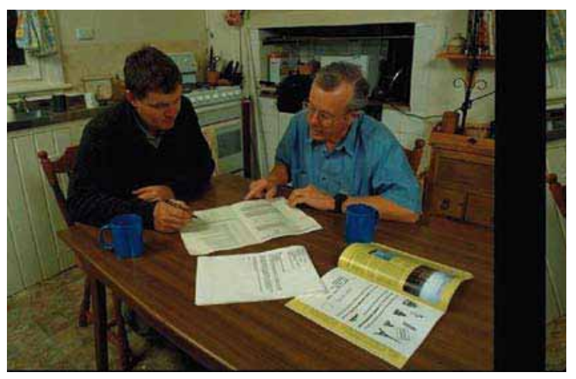
Getting advice from experts can help you make better fertilising decisions