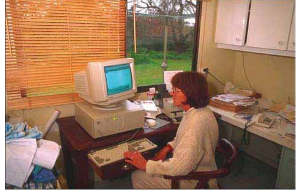
Several basic computer programs can help you keep, retrieve and summarise records

Fertiliser Research. 2002. Code of practice for fertiliser use. Available online at <u>www.fertresearch.org.nz.</u>